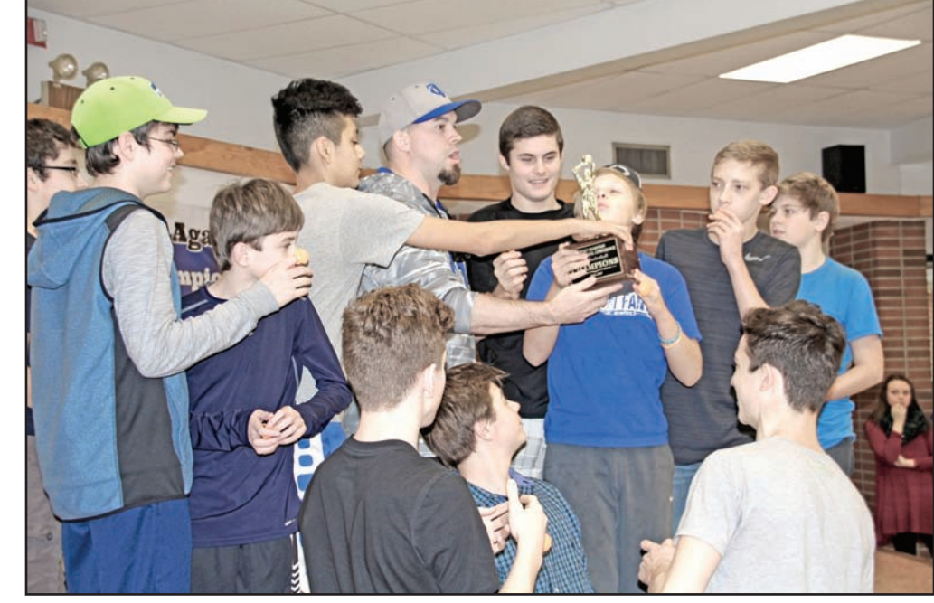
The Towns County Middle School Boys Basketball Indians celebrate with cupcakes and a big trophy following their co-champion victory over the Eastern Division of the Smoky Mountain

our way, but we still were able to keep it together and win